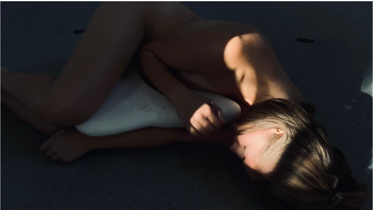
'Liquid Bodies' (2022) Durational Performance Performative Object | polished plaster, words