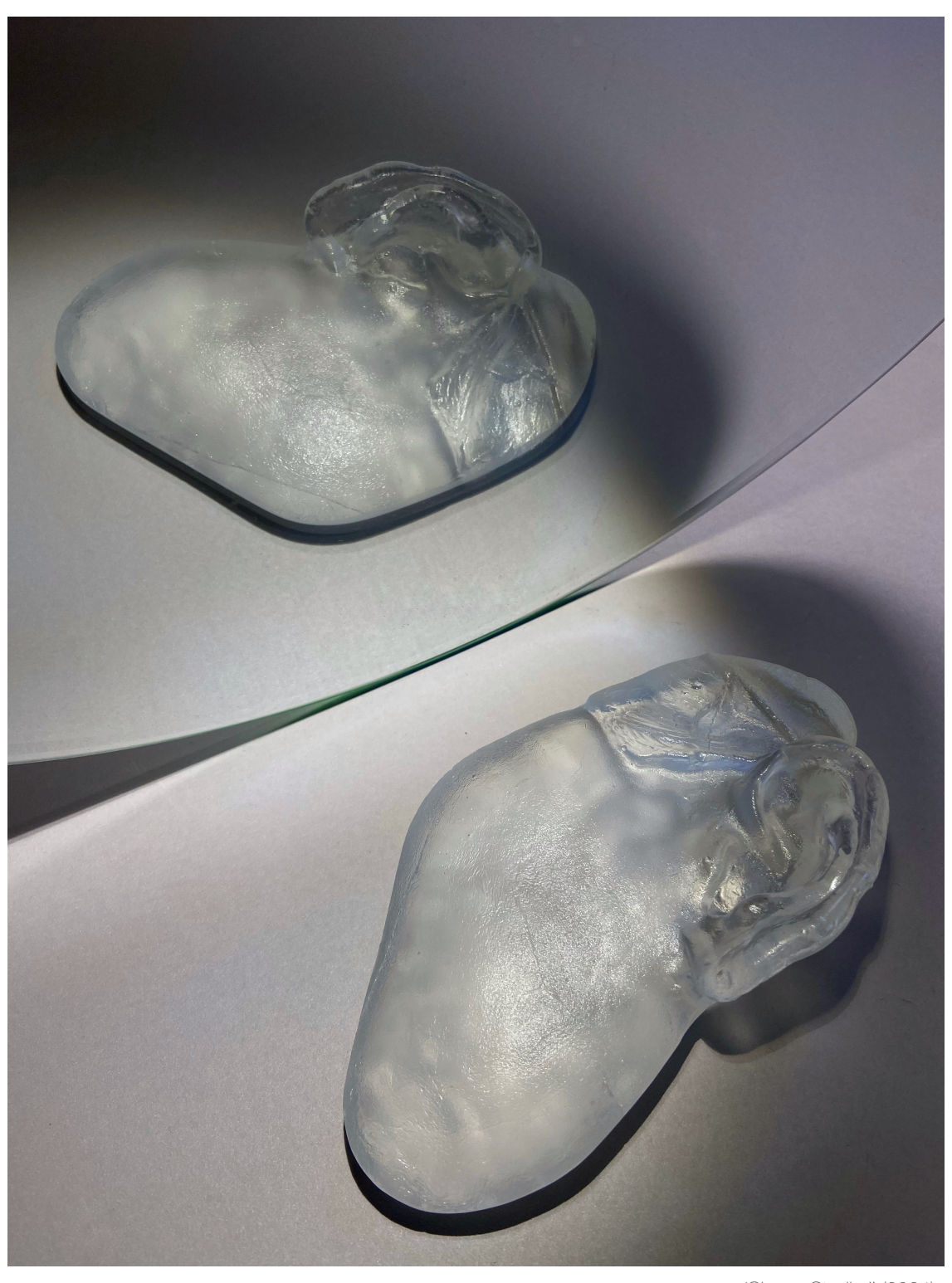
'Sinnes Studie I' (2024) 12 x 8 x 3cm Object | glass