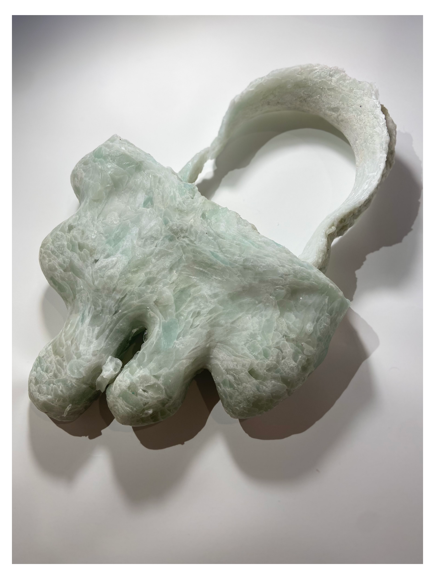
'Untitled (Recycled Glass Cast II)' (2022) 30 x 40 x 16cm Object | recycled glass