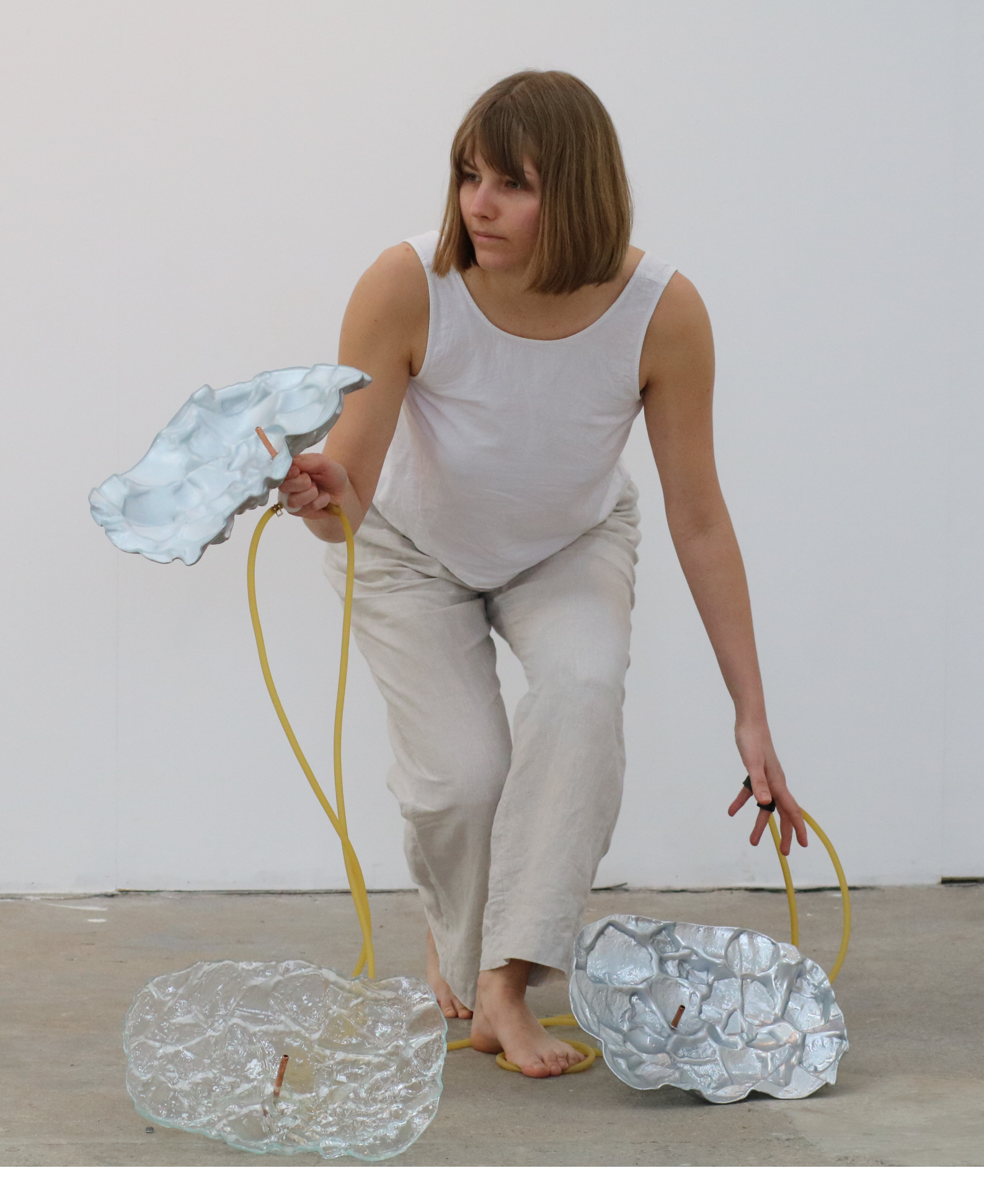
'Antenna' (2024) Durational Performance Performative Objects | glass, natural rubber, copper