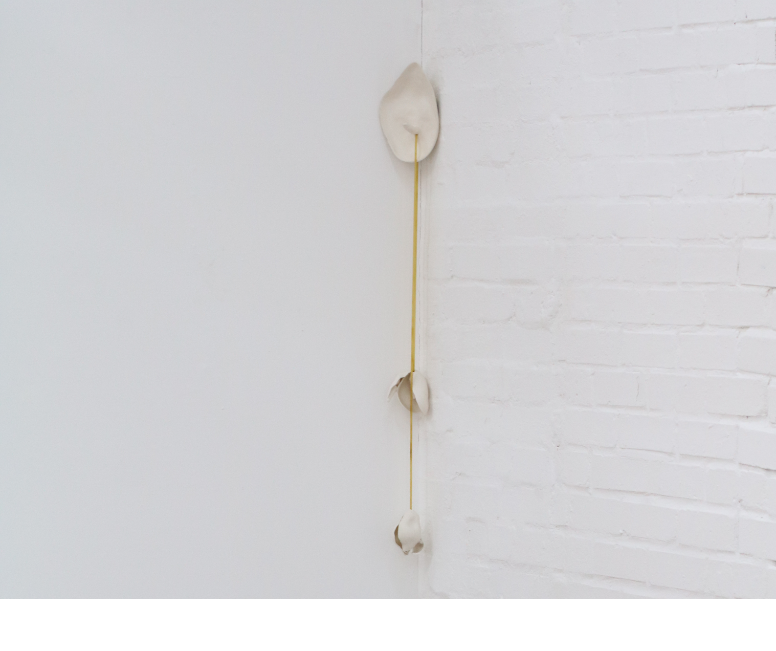
'Mother of Pearl' (2024) Durational Performance Performative Objects | porcelain, natural rubber, milk