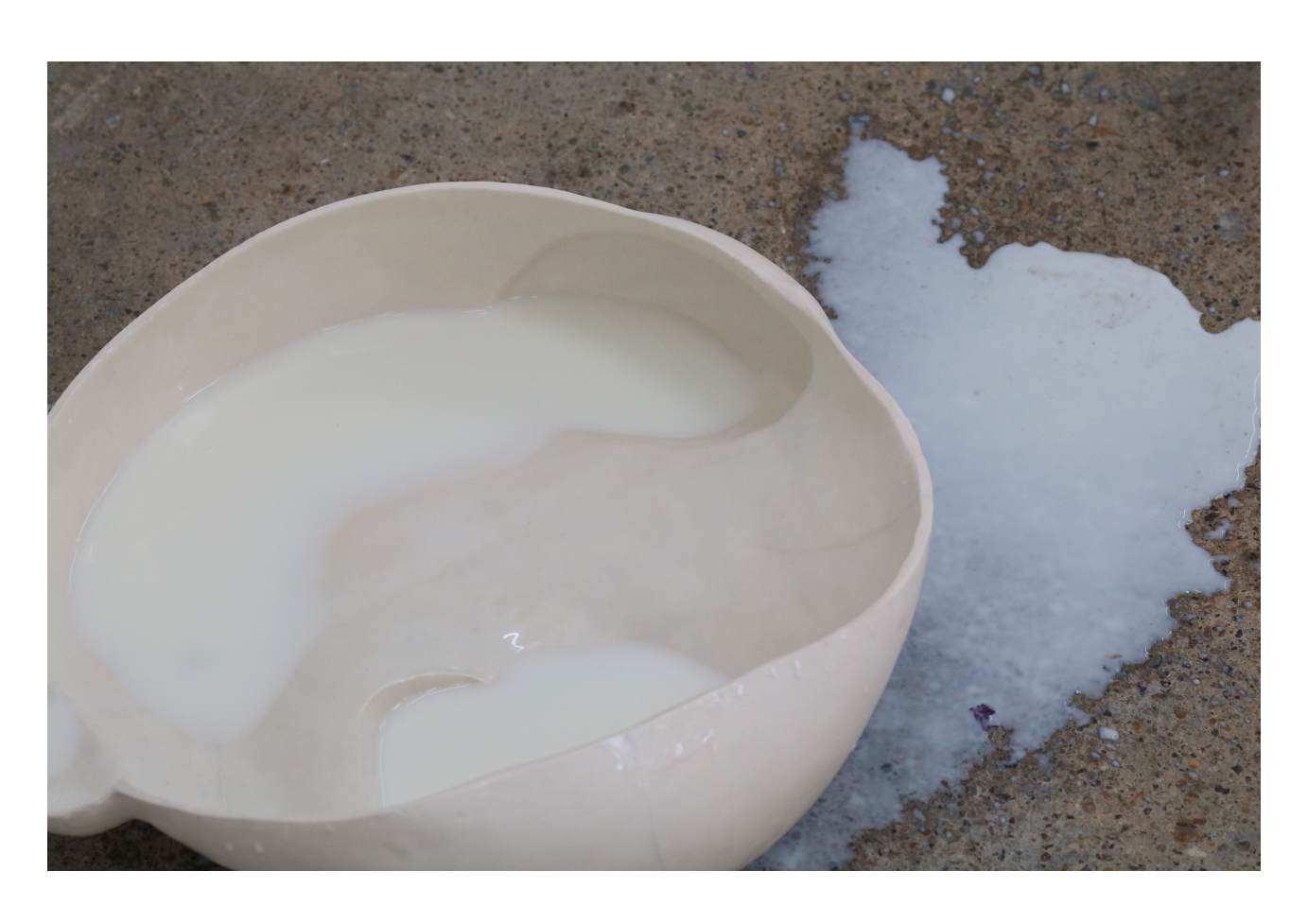
'Mother of Pearl' (2024) Durational Performance Performative Objects | porcelain, natural rubber, milk